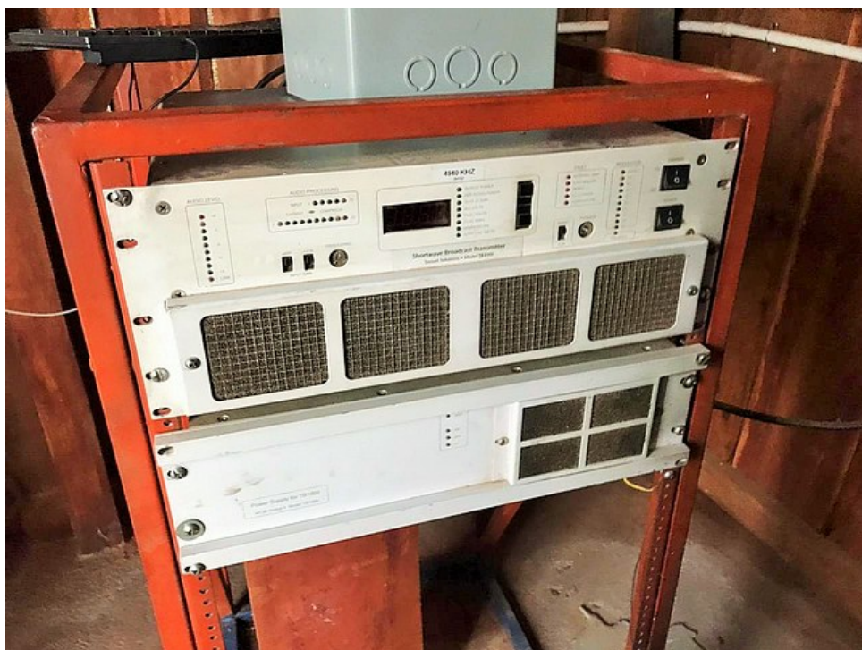
Left Estación 4940 transmitter and technician

(Estacion 4940 is heard well mornings 0800-1130 UTC here in SW Florida. They seem to have extended their sign-off time to 1130 UTC for 2025 and don't seem play the Venezuelan National Anthem anymore at sign-off.)