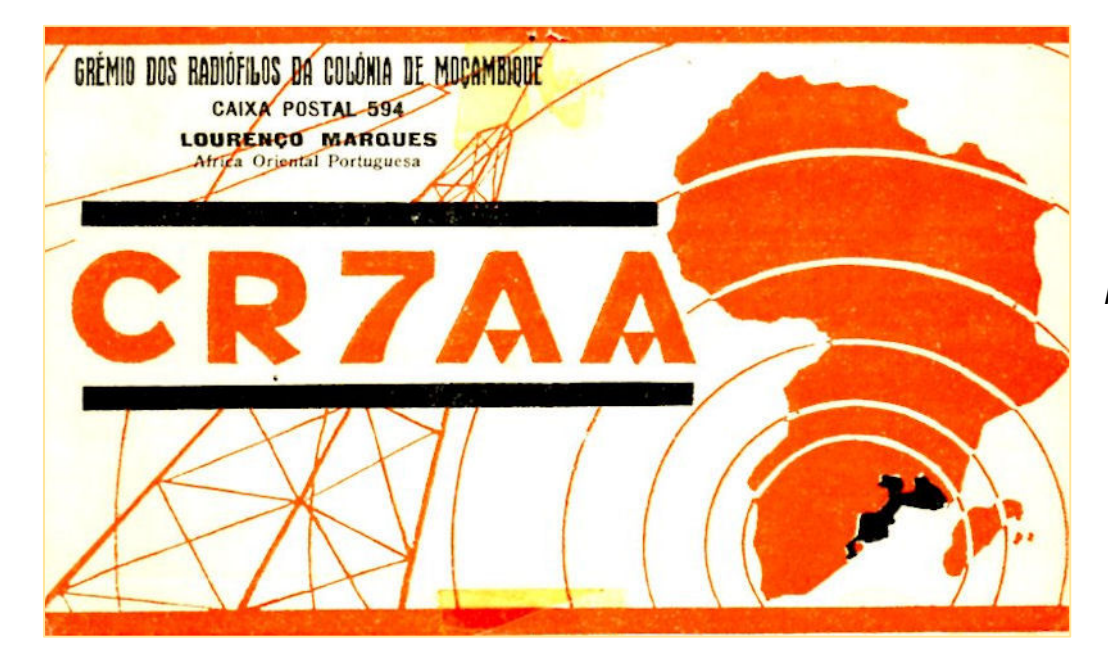
1930s QSL from CR7AA in Lourenco Marques, Portuguese East Africa (now Maputo Mozambique)

A Radio Nederland PCJ QSL from the late 1940s showing the remarkable wooden rotating beam aerials at Huizen. (They were constructed in 1937 and demolished in 1940)